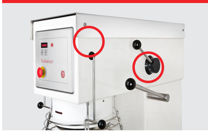
VL-1L - Manual speed regulation and automatic bowl lowering