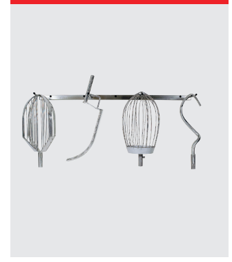
Tool rack, 127 cm