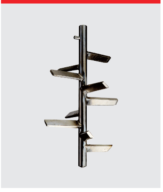
Powder mixer, stainless steel