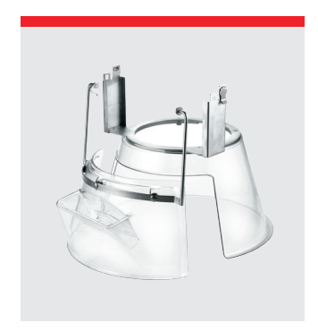
Removable safety guard in plastic. CE-certified