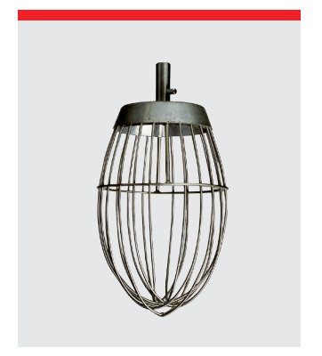
Whip with reinforcement