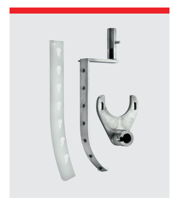
Automatic scraper, stainless steel. Nylon or teflon blade. 100L, 100/60l, and 100/40L.