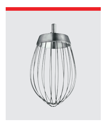
Whip with 1 mm thicker wires, stainless steel