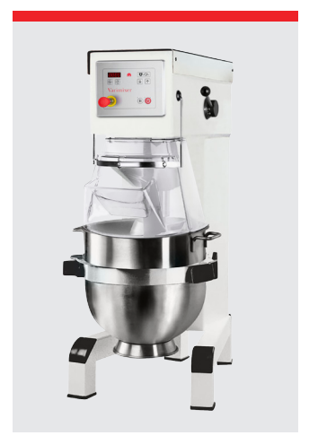
White, powder coated