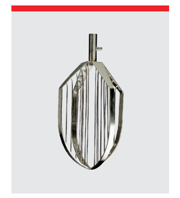
Wing whip, stainless steel