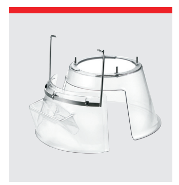
Fixed safety guard in plastic. CE-certified