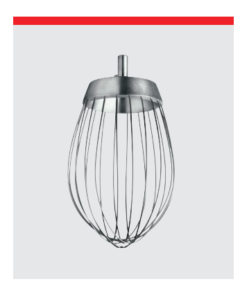
Whip with thinner wires, stainless steel