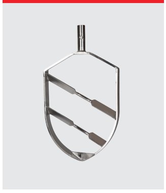
Beater, stainless steel