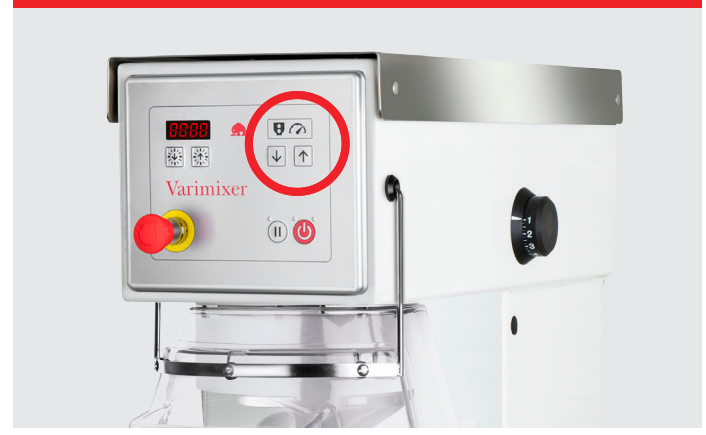
VL-1S - Automatic speed regulation and automatic bowl lowering