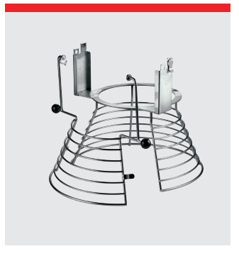
Removable safety guard in stainless steel. Not CE-certified