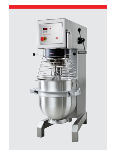
Marine version, stainless steel