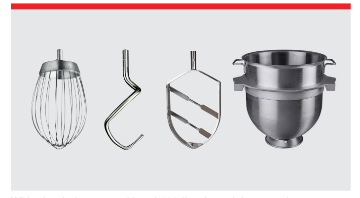
Whip, hook, beater and bowl 100 liter in stainless steel.